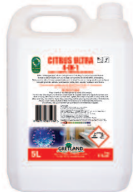
CONCENTRATED DILUTE 2% 1:50

*Certified to EN 14476 (1 minute contact time)