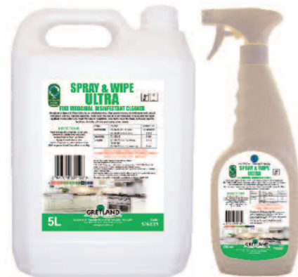
READY TO USE

Certified against Coronavirus* with a 1 minute contact time